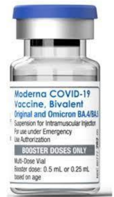
Royal Blue Cap & Grey Label